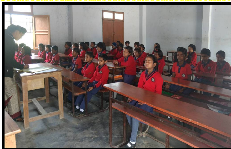
Meditation before exam for reducing stress!