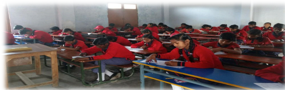
Students of class nursery to 8 th are busy in annual exam.